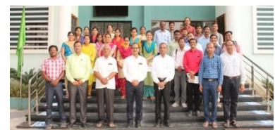
Resource persons deliver lectures on various topics in the Teacher Enrichment Programme