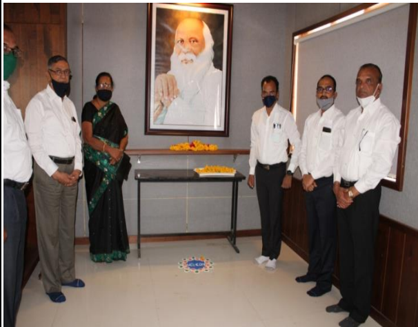
Inaugural of seminar in the presence of dignitaries