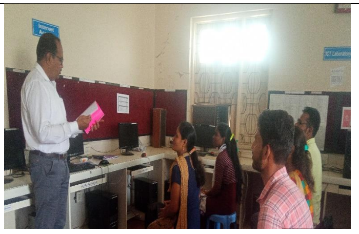
One Day Seminar on “Writing Effective Research Paper and Research Proposals” held on 15 th Nov., 2021