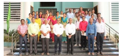
Resource persons deliver lectures on various topics in the Teacher Enrichment Programme