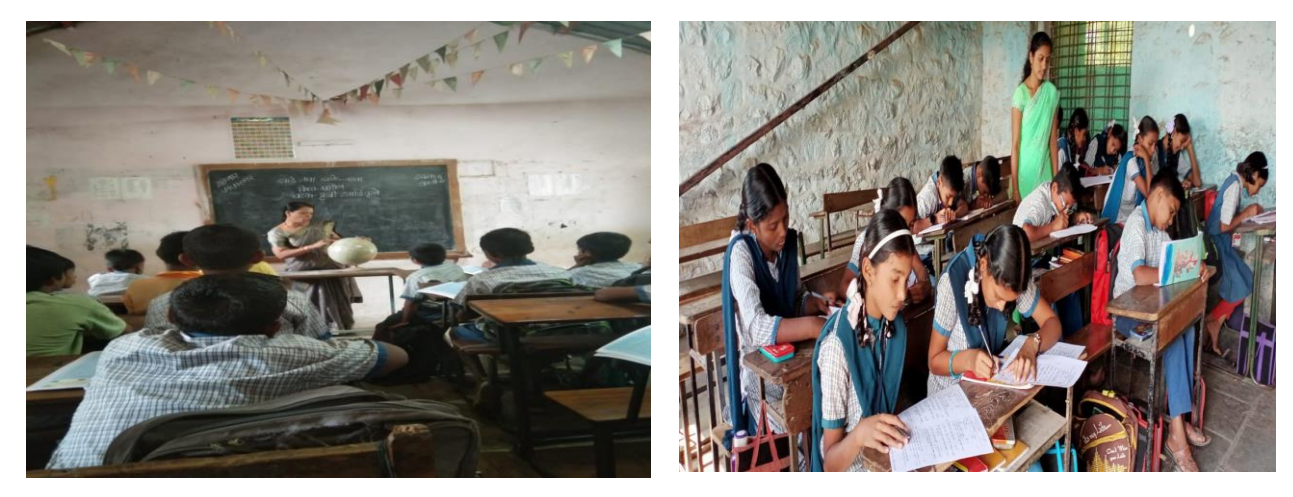
Student Teachers conductiong Lessons in the class room.