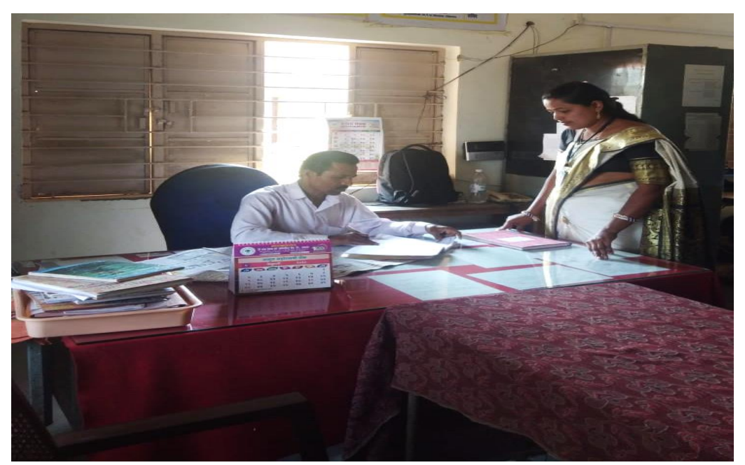
Discussion on observation of lessons of experienced Teacher

A. Observation of lessons of experienced school teachers.