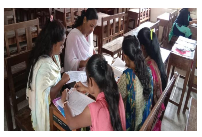
Student Teachers Discussing on Plan of Evaluation

The student teacher has formulated a Unit Plan that incorporates formative assessment (for each lesson plan) and summative evaluation (a unit test upon unit completion) for the aforementioned chosen units. They have created and administered the unit test, along with crafting a blueprint, model answers, and a marking scheme for the administered test.