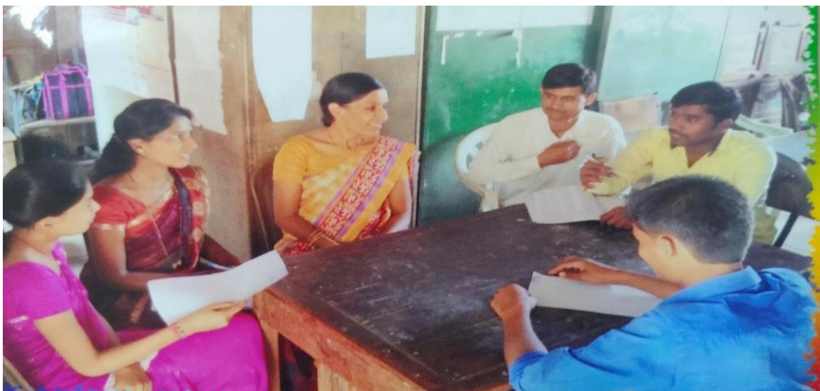
Student Teachers taking guidance from School teacher for developing lesson plans to cater to the diverse needs of the students.