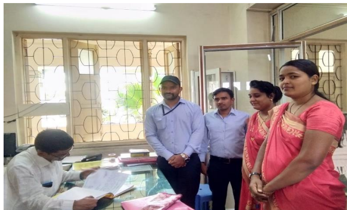
Student Teachers taking guidance from Professor to plan unit test.

The student teacher has formulated a Unit Plan that incorporates formative assessment (for each lesson plan) and summative evaluation (a unit test upon unit completion) for the aforementioned chosen units. They have created and administered the unit test, along with crafting a blueprint, model answers, and a marking scheme for the administered test.