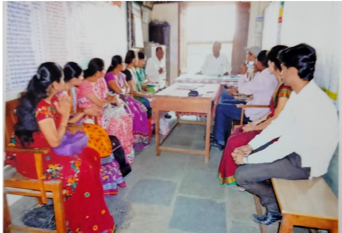
School Headmaster sharing information regarding the records maintained by the school

This activity aims to familiarize the student teacher with the administrative facets of school life. It aids them in recognizing the necessity and importance of record-keeping and comprehending its significance in ensuring the school's seamless operation. As part of this, the student teacher composed a report concerning four selected records that are created and upheld by the school.