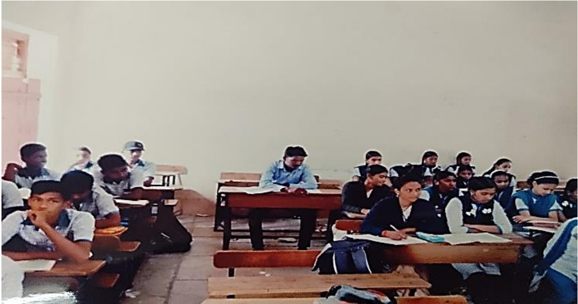
Student Teacher Observing lessons of experienced school teachers.