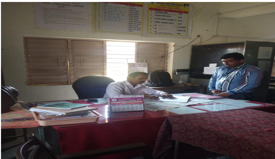
Student teacher taking guidance to develop lesson plans to cater to the diverse needs of the students