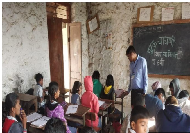
Student teacher conducting unit test

The student teacher has formulated a Unit Plan that incorporates formative assessment (for each lesson plan) and summative evaluation (a unit test upon unit completion) for the aforementioned chosen units. They have created and administered the unit test, along with crafting a blueprint, model answers, and a marking scheme for the administered test.