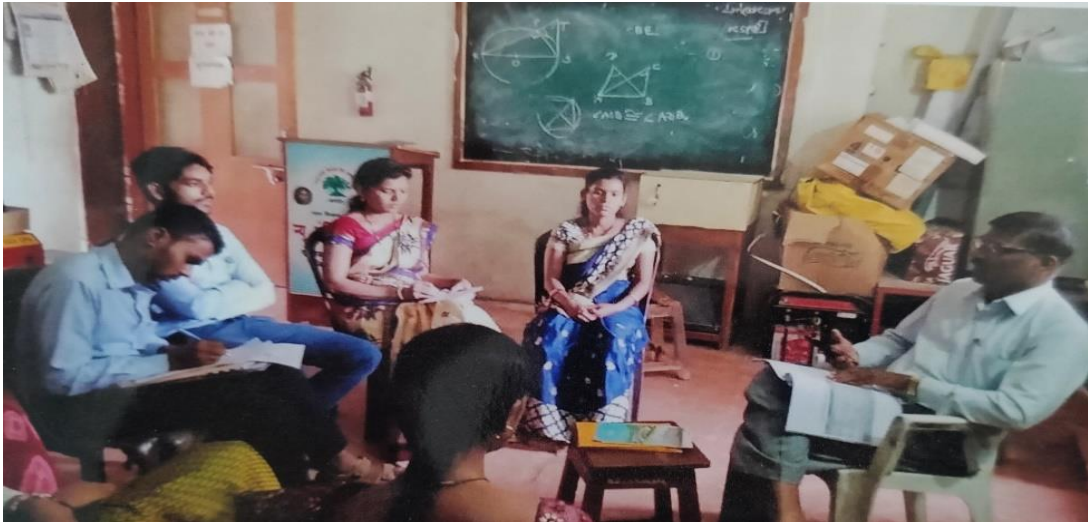
Student Teacher giving Feedback on observation of lesson