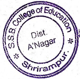
PRINCIPAL S.S.B. College of Education Shrirampur, Dist. A.Nagar