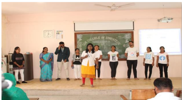
Drama presentation on social issues