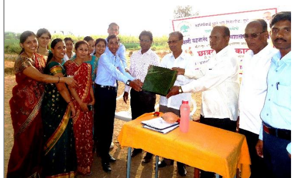
Training programme at practising school