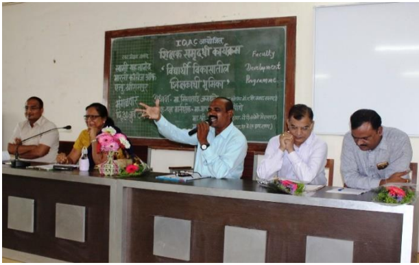
One Day Faculty Development programme on Teachers' Role in Students Development