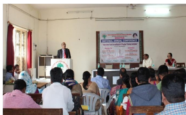
Two Day National Annual conference on Assessment & Accreditation of Teacher Education Institutes