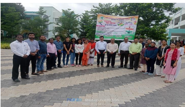
Participation in extension activity