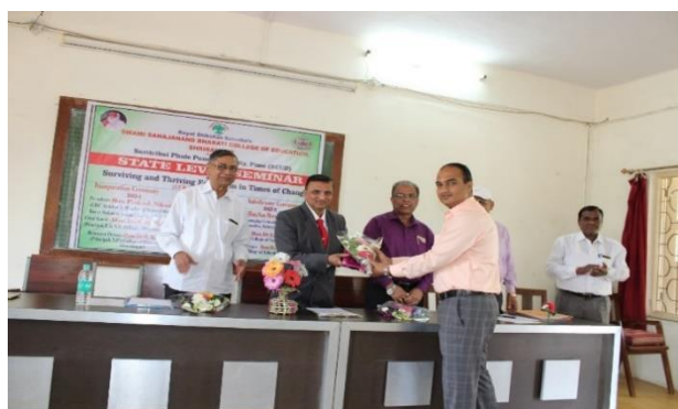
State level seminar on Surviving & Thriving Education in Times of Change