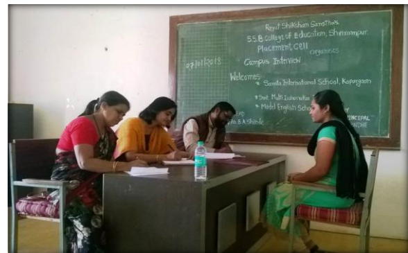
Campus Interview session by Placement Cell