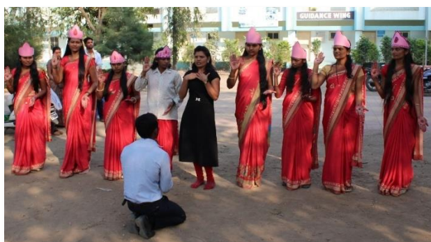
NSS Volunteers presenting Street play on the Importance of Constitution of India