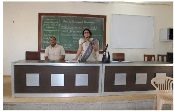
FDP on Teach to learn & Learn to Teach