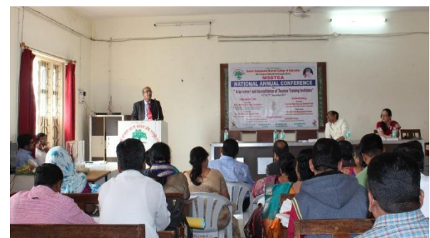
Two Day National Annual conference on Assessment & Accreditation of TEI