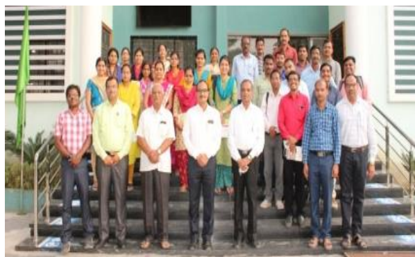
Participants Teacher Enrichment Programme